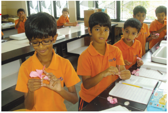
Inventure Academy, Bangalore class in session

Among the schools which have risen to higher places well above the salt at the southern region top table are the Valley